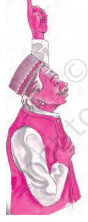
22 / Moments

"Who is this rich merchant who kept you from finishing this poor woman's jewellery, made her walk up and down, which distracted this bricklayer, which made a mess of his wall, which has now