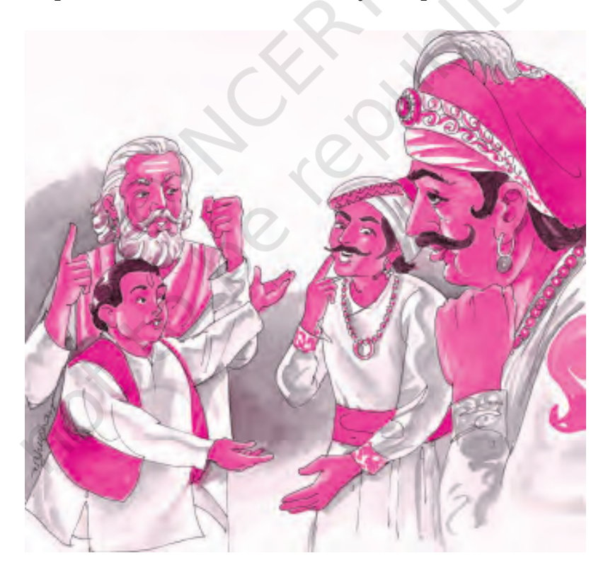
24 / Moments

"Of course, the guru. No doubt about it. Why do you ask?" "Then put me to the stake first. Put my disciple to death after me."